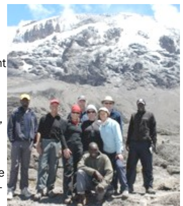
Find the DSG members!!