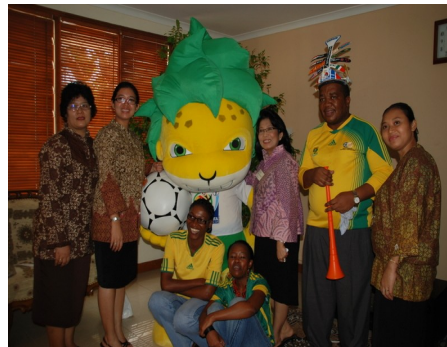
DSG members and guests at the February meeting

Variety of stadiums in South African cities.