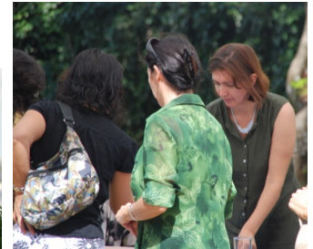
Dar es Salaam.