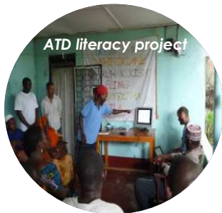
ATD literacy project