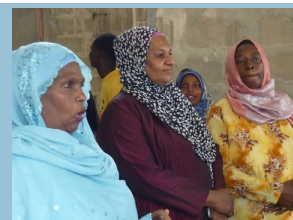
To the right is a photo of the women of COWPZ (Zanzibar)