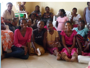
To the left is a photo of young women of CHIPUA (Dar es Salaam).

In addition to supporting projects with funds raised at the bazaar and other DSG events, the DSG has been able to donate 15,000,000/= as a result of a very generous donation from the French NGO , Ecole pour Tous , that supports schools. The following projects will be benefiting from this source: Emusoi, Loreto School, CHIPUA, ECONEF, Children's Cancer Ward and ATD street library (Tandale).