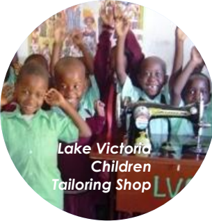
Lake Victoria Children Tailoring Shop