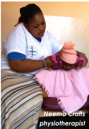
Neema Crafts physiotherapist