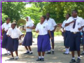
Buguruni School for the Deaf; a past DSG recipient