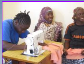
Moyo Mmoja in Bagamoyo

As I reported in the last newsletter, the committee continues to follow up on this year's projects. This involves requesting reports and making visits to ensure that the DSG money was spent for the purpose it was donated. Recently, some of our members visited two organisations in the Bagamoyo area: Kidzcare and Moyo Mmoja. The first is a children's centre well known to the DSG, where we gave some medical equipment; the second is a vocational training centre for young women, where we provided funds for the refurbishment of their workshop.